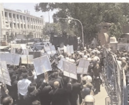
LAHORE: Lawyers gathered for a protest or strike.