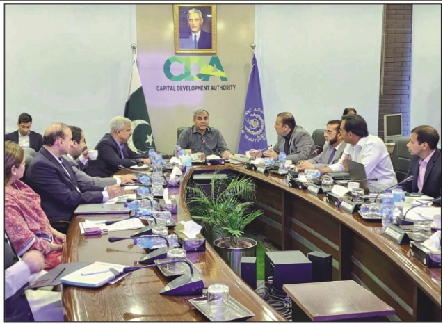
ISLAMABAD: Federal Minister for Interior Mohsin Naqvi chairing a meeting at CDA headquarters.