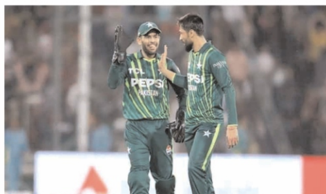
In Ireland, Pakistan will play three T20 matches on May 10, 12 and 14.

Meanwhile, Pakistan cricket team has reached Dublin and it will hold the first training session on May 9 after a day-long rest.