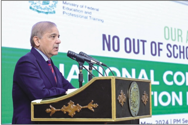
ISLAMABAD: Prime Minister Muhammad Shehbaz Sharif addresses the National Conference on Education Emergency.

ISLAMABAD: Pakistan's lunar mission (ICUBE-Q) entered the moon orbit on Wednesday. Pakistan's historic lunar mission (ICUBE-Q) was launched on Friday on board China's Chang'E6 from Hainan, China, according to the IST, the satellite ICUBE-Q has been designed and developed by IST in collaboration with China's Chang'E6 mission. ICUBE-Q orbiter carries two optical cameras to image the lunar surface. Following successful qualification and testing, ICUBE-Q has now been integrated with the Chang'E6 mission. The satellite is the first in a series of China's lunar exploration missions. The launch activity was telecast live on the IST website and social media platforms. Chang'E6, China's Lunar Mission will touch down on the Moon's far side to collect samples for return to Earth for research.