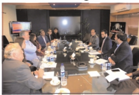
The government under the leadership of Shehbaz Sharif restored the film policy in its previous term," he said and added that the film sector had been given the status of an industry so that the youth could get an opportunity to enter this sector. He said a film finance fund had been established at Rs 1 billion in the budget of 2022-23. Moreover, he said medical insurance for artists and tax incentives

for the film industry had boosted the film industry and its related sectors. He said in the budget 2022-23, five years of tax exemption was given to filmmakers. Similarly, income tax exemption of five years has been given on the establishment of new cinemas, production houses, and film museums which as a tax exemption has been given for ten years on the export of film and during.