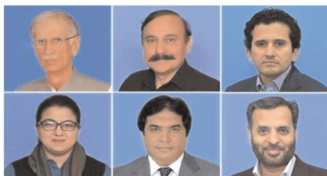
New cabinet members including Pervez Khattak. Khattak is appointed as Adviser to Prime Minister on Interior Affairs. Other new members include Tariq Fazal Chaudhry, Ali Pervaiz Malik, and Shaukat Faizma Khawaja.

two state ministers were elevated to post of the federal minister. According to a notification issued by the Cabinet Division today, federal minister Tariq Fazal Chaudhry has been given the portfolio of Parliamentary Affairs, while Ali Pervaiz Malik and Shaukat Faizma Khawaja made the federal ministers of Petroleum and Information Technology, respectively. Interestingly, Pervez Khattak, once a close aide of incarcerated former prime minister Imran Khan and former Khayber Pakhtunkhwa chief minister — has been