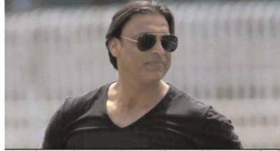
Champions Trophy 2025, Akhtar expressed his disappointment. However, he lauded Babar Azam, Mohammad Rizwan, Shaheen Shah Afridi and others saying we feel extremely happy when they perform well. By hosting the Champions Trophy we have proved that Pakistan is a safe haven and there is no problem of security here.

Akhtar emphasized the significance of CPL in connecting overseas Pakistanis with their roots. "This league is an important effort to bridge the gap between overseas Pakistanis and Pakistan. It's a great initiative, and I'll try my best to support it," he said. When asked about Pakistan's early exit from the ICC