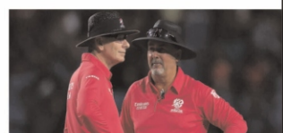
Umpire of the Year Illingworth also stood in the final of the most recent ICC Men's Cricket World Cup in 2023, as well as the ICC Men's T20 World Cup 2024, and took charge of the Group A match between the two finalists, which India won by 44 runs.

Both stood in the semi-finals, with Illingworth in the middle for India's four-wicket win over Australia and Reiffel overseeing the Black Caps' 50-run victory over South Africa the following day, said a press release.