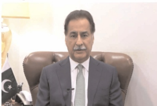
Ayaz Sadiq speaking at a podium. He emphasized the importance of empowering women for a progressive society and mentioned the role of the Parliament and various committees.

progress. He emphasized the necessity of advancing women in economic sectors and encouraging their participation to ensure financial stability. Reaffirming the commitment of the Parliament, he ensured the implementation of all possible measures to empower women, secure their rights, and grant them their rightful place in society. He further stated that the Parliament of Pakistan has substantial female representation, actively contributing to the legislative process. Ayaz Sadiq said that the Women's Parliamentary Caucus and the Special Committee on Gender Mainstreaming are playing an active role in advocating for women's rights and enhancing their political and social well-