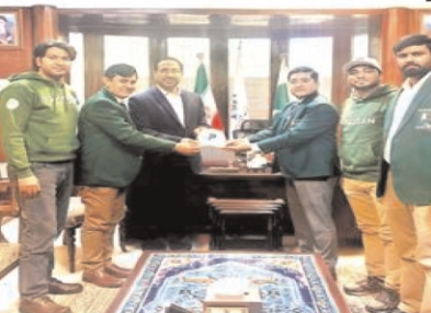
ensure Pakistan's smooth participation in the championship while strengthening bilateral baseball ties. Discussions focused on facilitating the travel and