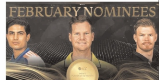
Shubman Gill compiled 406 runs, averaging 101.50 at a strike-rate of 94.19.

In the one-day series, he scored 12 and 29, and then going into the ICC Champions Trophy, which will be his last international tournament in the format - he got five against England and then not out against Afghanistan. In his five one-day internationals over the course of the month, Indian batter