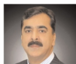
national treasury in freight subsidies.

In the previous hearings, the verdict on three cases against Gilani had been reserved. The former prime minister was accused of causing a loss of over Rs 6 billion to the