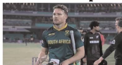
final opponent remained uncertain until their victory over New Zealand in the third league match. After India's win, South

Both semi-finalists from Group B, South Africa and Australia, had to travel to Dubai after finishing their group-stage matches, as India's semi-