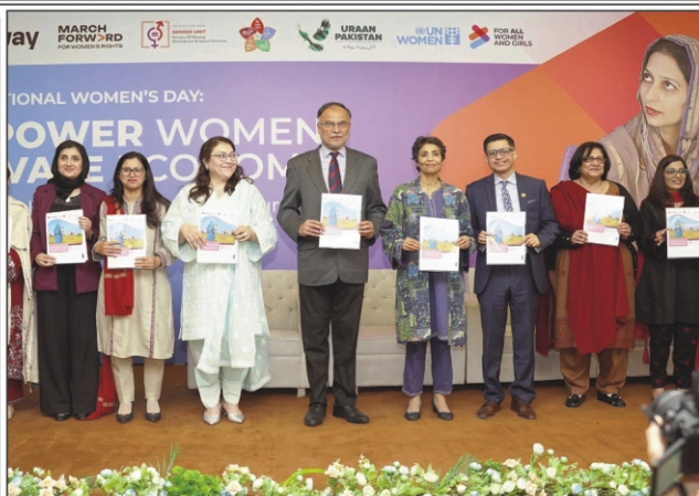
ISLAMABAD: Federal Minister for Planning, Development, and Special Initiatives, Ahsan Iqbal, launching the Gender Action Plan 2023-26 Report at the MoPDSI during an International Women's Day ceremony at MoPDSI.

A Bloomberg article compares that in dollar terms, a litre of packaged milk costs $1.33 compared with $1.29 in Amsterdam, $1.23 in