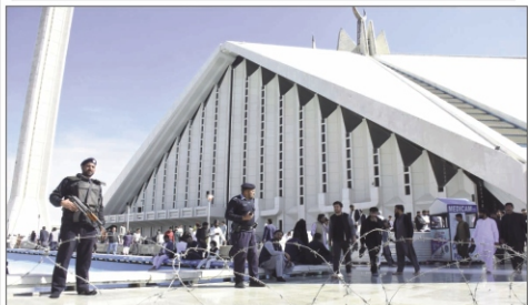
ISLAMABAD: Police personnel stand guard to counter any unexpected situation during the Nimaz-e-Juma at Shah Faisal Mosque in Federal Capital.