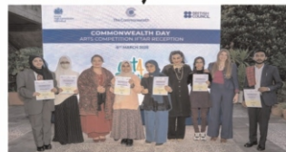
petition received over 550 creative submissions, demonstrating the enthusiasm and commitment of youth toward climate awareness.

Young Pakistanis aged 13 to 24 from across the country were invited to participate, sharing their artistic expressions on how climate change affects their lives and communities. Organized in collaboration with the British Council, the com-