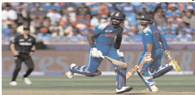
Valuable batting depth, Rohit was delighted with the form of key players going into the title decider.

With Mohammed Shami filling in superbly for injured pacer Jasprit Bumrah, and all-rounder Hardik Pandya offering