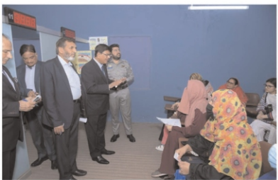
The Team also directed to develop a mechanism for keeping the motorcycles and heavy duty vehicles on extreme left side of the road. It also instructed that necessary facilities may be provided for seating the customers under the shade along with provision of cool drinking water there.