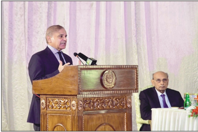
ISLAMABAD: Prime Minister Muhammad Shehbaz Sharif addresses a banquet organized in honor of the delegation of businessmen and Investors led by the Saudi Assistant Minister Ibrahim Al-Mubarak.

The Punjab CM attributed the agreement between Pakistan and Saudi Arabia's investors as a welcoming gesture.