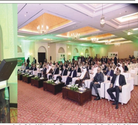
ISLAMABAD: Muhammad Aurangzeb, the Federal Minister for Finance, addressing the Saudi Arabia-Pakistan Investment Forum 2024.

balancing. He said that recently Prime Minister Shehbaz Sharif on the side line of World Economic Forum. It was a successful visit to Saudi Arabia, which opened the way for economic cooperation between the two countries. Muhammad Aurangzeb said that in the last two weeks, three high-level delegations have been exchanged between Saudi Arabia and Pakistan. Today, the visit of a delegation of Saudi investors to Pakistan is also a part of paving the way for this economic cooperation.