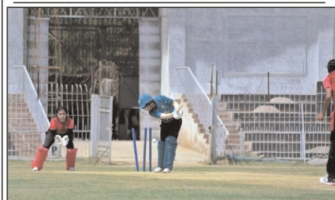
FAISALABAD: May 06 - Players in action during cricket match played between KARACHI Women and Lahore Women cricket teams during National Women's One Day Cricket Tournament 2024 at Iqbal Stadium.