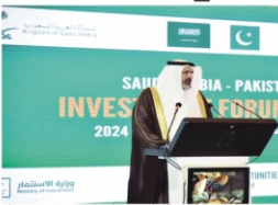
ISLAMABAD: Deputy Investment Minister Ibrahim Almubarak speaks at the Pakistan Saudi Arabia Investment Conference 2024.

tioned that Saudi Arabia is a home to about two million Pakistanis who have contributed significantly to the Kingdom's vision 2030.