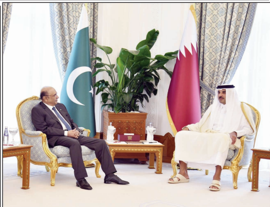
DOHA: President Asif Ali Zardari in a meeting with His Highness Sheikh Tamim bin Hamad Al Thani, Amir of the State of Qatar, at the Amiri Palace.

Qatar is one of the two mediators in talks between Pakistan and the Afghan Taliban, which were held in Doha and Istanbul following border clashes between the two sides last month. Another round of talks between them is set to begin tomorrow (Nov 6) in the Turkish capital.