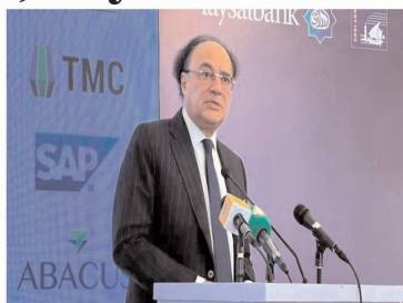
International Airlines (PIA) will be completed before the end of the year, alongside ongoing efforts to privatize three distribution companies. The first women's bank has

FinMin confirmed that the privatization of Pakistan