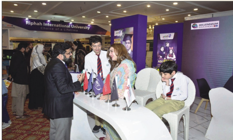
RAWALPINDI: Visitors are busy in buying books on a stall during education expo organized by RCCIA, in the City.