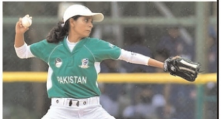
WAPDA, HEC and Police will participate in the championship. The final of the championship will be played on March 16.