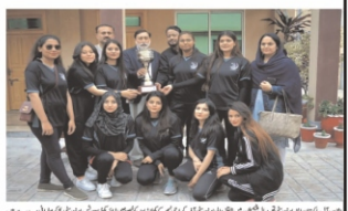
In the Men's final, Peshawar University defeated Islamabad College University by 2-1, the score was 25-19, 22-25 and 25-19, while in the women final, Karachi University defeated Shaheed Benazir Bhutto Women University by 2-1, the score was 18-25, 25-21 and 25-19. In the Men category, Abdul Wali Khan University Mardan recorded victory against Punjab University and secured third position, the score was 2-1, the score 15-25.