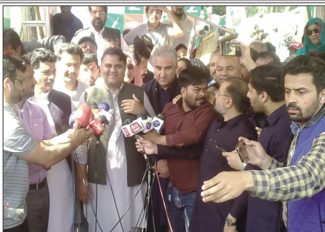
LAHORE: Leader of PTI Fawad Chaudhry talking with media persons outside residence of Pakistan Tehreek-e-Insaf (PTI) of former Prime Minister Imran Khan, in Provincial Capital.

However, Deputy Commissioner (DC) Rafia Haider had rejected the plea citing "the current security scenario, threat alerts, and law and order situation, and in light of activities like controversial cards and banners for awareness of the women's