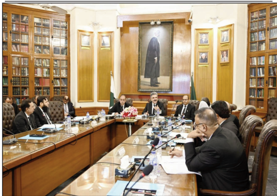
Hon'ble Chief Justice of Pakistan in a meeting with district and sessions judges of Karachi Division, Hon'ble Chief Justice and Judges of High Court of Sindh were also present in the meeting at Sindh High Court Building Karachi.

The visit reaffirmed the judiciary's commitment to institutional development, participatory planning, and the delivery of accessible and efficient justice.