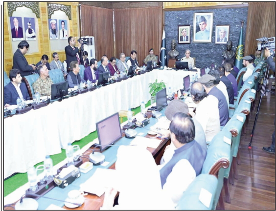
GILGIT: Prime Minister Muhammad Shehbaz Sharif chairs a meeting regarding the recent floods and rehabilitation work in Gilgit Baltistan.

for Gilgit-Baltistan in the coming months, the prime minister said adding that a comprehensive system must be developed for immediate rescue and assistance in emergency situations. He instructed NDMA to ensure close cooperation with provincial governments and relevant institutions to enhance rescue and relief efforts. "All rehabilitation measures for those affected by the recent monsoon must be completed promptly," the prime minister said emphasizing that a survey of damage to roads and infrastructure should be conducted, and communication links in all affected areas must be restored on a priority basis. The prime minister also expressed sorrow over the loss of lives during recent rains and floods in the area.