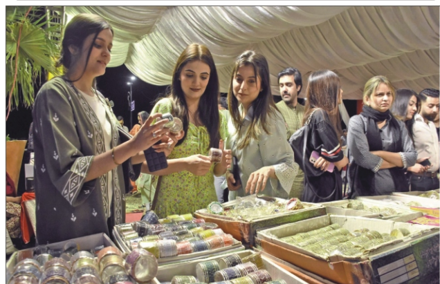
ISLAMABAD: Women are buying bangles on stall at a local shopping mall ahead of the Muslim festivities of Eid al-Fitr in the Federal Capital.