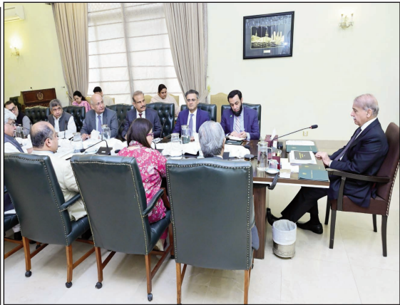
ISLAMABAD: Prime Minister Muhammad Shehbaz Sharif chairs a meeting regarding matters related to FBR.

a 1.5 per cent rise over last year. Prime Minister Shehbaz Sharif emphasized that no institutional complacency will be tolerated in achieving revenue targets and other economic goals for the new fiscal year. "All departments must work with complete dedication," he said, reaffirming his personal oversight of all stages of revenue collection and economic target implementation. He instructed FBR to treat taxpayers with dignity and respect and called upon all public sector institutions to extend full cooperation with the revenue authority. The prime minister also stressed the need to broaden the tax net through digitalization and enforcement. PM Sharif also issued key directives including expansion of the Track and Trace Digital Production System to cover all stages of production and distribution.