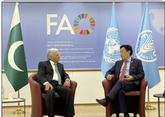
Federal Minister Rana Tanveer Hussain meeting with FAO Director-General Qu Dongyu during the 44th session of the FAO conference in Rome.

geted farmer subsidies. He also discussed new national policies on biotechnology, e-commerce integration for smallholders and soil health mapping. The minister noted significant outcomes such as the improved affordability of a healthy diet (from 37 percent of households in 2019 to 52 percent in 2024) and a drop in the real cost of healthy diets. However, he also underscored persistent challenges, including food insecurity affecting 36.9 percent of the population, rising input costs, and severe climate-induced stress. Calling for enhanced international cooperation, Mr. Hussain urged FAO to support Pakistan's access to climate financing, carbon markets, and adaptation mechanisms for vulnerable farming communities. Director-General Qu Dongyu appreciated Pakistan's strong reform momentum and reaffirmed FAO's continued technical and policy support. He praised Pakistan's efforts in climate-smart agriculture, digital innovation, and capacity building.