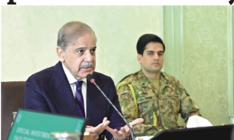
He said having achieved economic stability, the country had now entered the growth stage. "If we want to achieve the economic development,

As regards, foreign investment, the prime minister emphasized that the MoUs worth billions of dollars had already been signed with Saudi Arabia, Qatar and UAE.