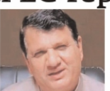
Muqam further accused certain quarters in the provincial setup of misappropriating NFC funds, calling for accountability and transparency in their utilization.

Senate Committee Deliberates on Solar Policy, Electric Vehicles, and Industrial Challenges He lamented the suffering of local representatives in the province.