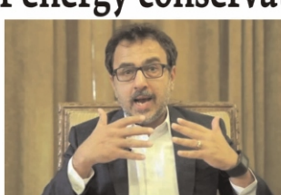
major reason for maintaining many power plants in the system, the implementation of the Code will also help in managing the peak demand helping the power sector to reduce operational costs and energy consumption.

Additionally, energy-efficient buildings contribute to the conservation of natural gas by reducing the need for heating during the winter season.