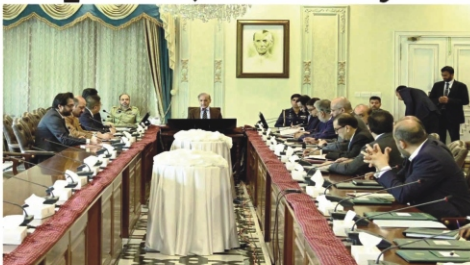
The meeting was told that Huawei, in collaboration with the Higher Education Commission of Pakistan, has introduced courses in

Artificial Intelligence, Cloud Computing, Big Data, and Cybersecurity at 15 Pakistani universities.