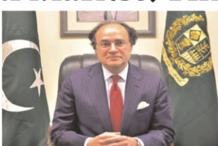
He emphasized Pakistan's desire to become a hub for the transfer of export-oriented facilities and services

It is pertinent to mention that the minister is visiting China, participating in the Boao Forum for Asia Annual Conference 2025. The minister praised China's efforts to open up