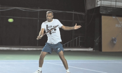
Aisam-ul-Haq Qureshi playing tennis on a court.