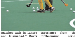
Oman national hockey team players on the field.