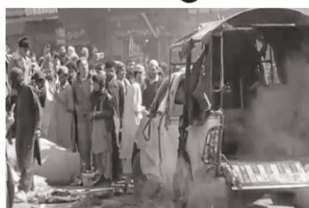
strongest terms. According to the statement, shared by state broadcaster PTV on X, the PM expressed grief and offered prayers for the families of the deceased and injured. He also ordered that authorities "immediately identify the incident, identify those responsible and bring them to justice."

A man was also seen pulling the burning wreckage of the motorcycle away from the vehicle in the video, while sirens could be heard in the background. No group has so far claimed responsibility for the blast. Prime Minister Shehbaz Sharif issued a statement condemning the Quetta blast in the