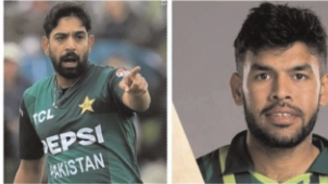
Haris Rauf and Usman Khan in Pakistan cricket gear.

Following the completion of the T20 series, the Pakistan team and coaching staff traveled from Wellington to Napier. Rauf and Usman, originally part of the T20 squad, have now been included in the ODI lineup.