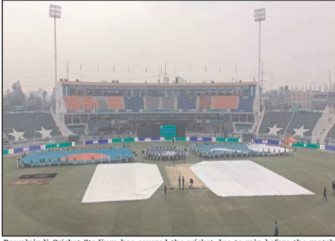
Rawalpindi Cricket Stadium has covered the wicket due to rain before the match between Pakistan and Bangladesh while the flag of Pakistan and Bangladesh was hoisted.