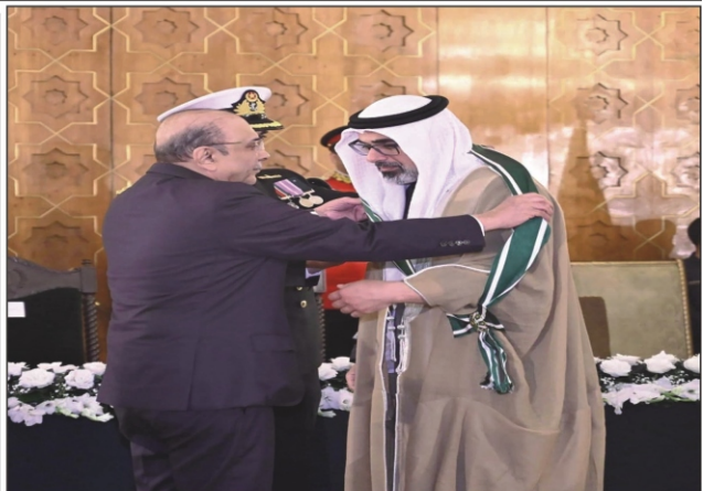
ISLAMABAD: President Asif Ali Zardari conferring the award of Nishan-i-Pakistan upon the Crown Prince of Abu Dhabi and Chairman of Abu Dhabi Executive Council, Sheikh Khalid bin Mohamed bin Zayed, at Alwan-e-Sadr.

tion and development. On the humanitarian front, Sheikh Khalid has demonstrated a profound commitment to global causes. He has led the numerous humanitarian initiatives that provide vital support to the underprivileged communities. His approach to humanitarian efforts reflects UAE's vision of global solidarity and support. Sheikh Khalid is a dynamic leader who has been instrumental in promoting economic, trade and investment cooperation between Pakistan and UAE. His leadership facilitated the advancement of significant investment initiatives in Pakistan economy aimed at boosting key sectors such as infrastructure, energy, healthcare and technology thereby contributing immensely to Pakistan's socio-economic progress.