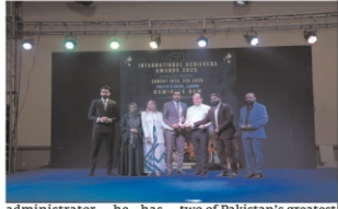
two of Pakistan's greatest sporting legends. Mr. Aisam's inclusion in this distinguished list further solidifies his legacy as a pioneer in Pakistani tennis and a national sports ambassador.

ISLAMABAD: Mr. Aisam-ul-Haq Qureshi, President of the Pakistan Tennis Federation-PTF, has been honored with the prestigious Sports Icon Award at the International Achievers Awards 2025 (3rd Edition), organized by West World Events in Lahore. This recognition celebrates Mr. Aisam's outstanding contributions to sports, both on national and international platforms. As one of Pakistan's most accomplished tennis players and a dedicated sports administrator, he has played a vital role in promoting tennis and inspiring future generations. The Sports Icon Award has previously been awarded to Jahanگیر Khan and Javed Miandad, two of Pakistan's greatest sporting legends. Mr. Aisam's inclusion in this distinguished list further solidifies his legacy as a pioneer in Pakistani tennis and a national sports ambassador.