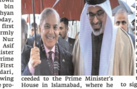
ceeded to the Prime Minister's House in Islamabad, where he

ISLAMABAD: Abu Dhabi Crown Prince Sheikh Khalid bin Mohamed bin Zayed Al Nahyan arrived in Pakistan today, February 27, 2025, for his first official visit. He was warmly received at Rawalpindi's Nur Khan Airbase by President Asif Ali Zardari, Prime Minister Shehbaz Sharif, Deputy Prime Minister Ishaq Dar, and first Lady Aseefa Bhutto-Zardari, among other officials. Following his arrival, the Crown Prince pro-