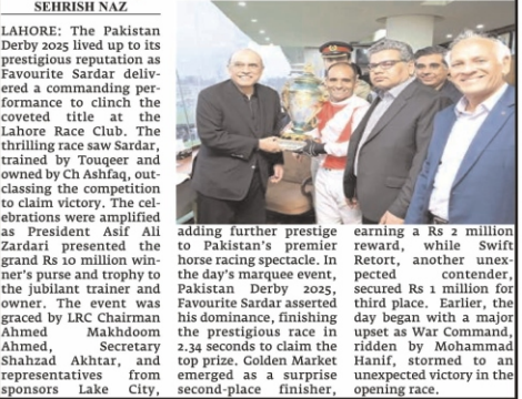
adding further prestige to Pakistan's premier horse racing spectacle in the day's marquee event, Pakistan Derby 2025, Favourite Sardar asserted his dominance, finishing the prestigious race in 2:24 seconds to claim the top prize. Golden Market emerged as a surprise second-place finisher,