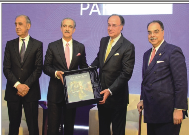
KARACHI: Federal Minister for Finance and Revenue Senator Muhammad Aurangzeb, being presented with memento at Pakistan Summit 2025.

is being engaged in tax policy formulation, as tax policy should not be limited only to mathematical calculations but it should also take the economic value in consideration. The government is introducing appropriate reforms and we will not give in, he categorically stated and vowed to take forward the reform agenda with the same spirit. "Pakistan needs to transform the DNA of its economy and move towards sustainable and inclusive growth," he argued. We are heading in the right direction and all these factors are boosting the confidence of investors in the national economy as well, he said and emphasized, but we need sustainability and resilience to face the emerging challenges.