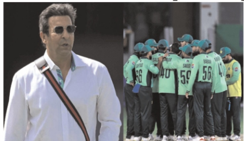
We are losing in white-ball cricket with these players for a couple of years now. It's time to take a bold step," Akram remarked, backing fellow former pacer Waqar Younis' suggestion to introduce fresh talent even if it means short-term losses. Akram also highlighted Pakistan's poor bowling performances, revealing that the team's bowlers