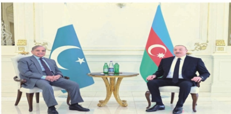
of the strong friendship. They also emphasised the importance of further enhancing bilateral trade and investment and to explore joint investment

Azerbaijan's President accepted the Prime Minister's invitation to visit Pakistan in April 2025 to sign various important agreements. Both leaders reaffirmed their commitment to the strategic partnership between the two countries and expressed satisfaction on the steady growth and consolidation