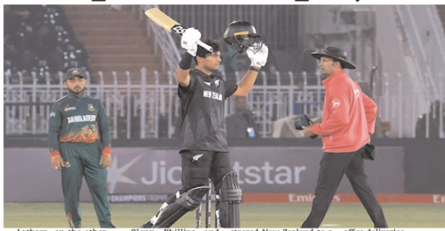
Latham, on the other hand, walked back in the 42nd over after contributing 55 from 76 deliveries, laced with three fours. Glenn Phillips and Michael Bracewell then ensured there were no further hiccups in the modest run chase and

Williamson (five) inside four overs with just 15 runs on the board. Following the early stumble, returning Ravindra joined Conway in the middle and launched recovery. The duo shared an important 57-run partnership for the third wicket until Mustafizur Rahman struck in the 16th over to get rid of the opening batter, who scored 30 off 45 deliveries, hitting six fours. Ravindra then joined forces with Latham and put New Zealand in a commanding position with a 129-run partnership. He eventually fell victim to Rishad Hossain in the 39th over after top-scoring for New Zealand with 112 off 105 deliveries, studded with 12 fours and a six.