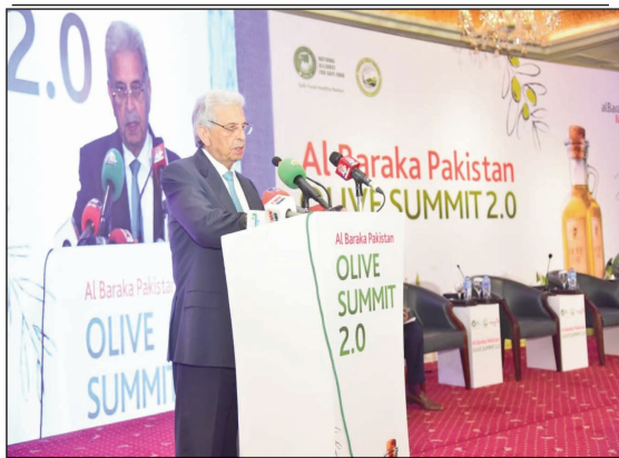
ISLAMABAD: Federal Minister for National Food Security and Research, Rana Tanveer Hussain, addressing the Pakistan Olive Summit 2.0 at Serena hotel.

By promoting the olive sector, Pakistan could significantly reduce its dependence on edible oil imports, saving billions of rupees in foreign exchange each year, he said, adding that currently, Pakistan spends billions of dollars annually on edible oil imports, which can be substantially reduced by increasing domestic olive production.