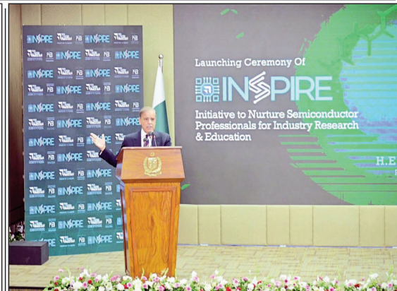
ISLAMABAD: Prime Minister Muhammad Shehbaz Sharif addresses the launching ceremony of Inspire, an initiative by Ministry of Information Technology to nurture Semiconductor Professionals for industry research and education.

In this address, Prime Minister Shehbaz said that the launch of INSPIRE was a milestone in Pakistan's transition toward a knowledge-based digital economy, where innovation, research, and human capital drive sustainable growth. "Our vision is to prepare Pakistan's youth for the industries of tomorrow... Through this initiative, we are building the foundations of a new economic frontier – one where Pakistan contributes talent, technology, and innovation to the world," he remarked.