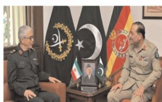
Forces calls on COAS Syed Asim Munir. He was warmly received, including a guard of honor presented by a singly turned-out contingent of the Pakistani Army.