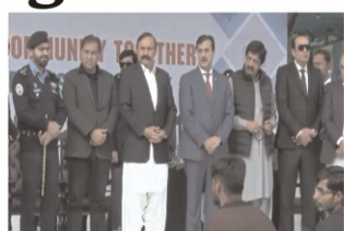
Health check-ups and preventive care. Among the distinguished guests were Chairman Senate Syed Yousof Raza Gillani, Governor Punjab Sardar Saleem Haider Khan, Chief Commissioner Islamabad Muhammad Ali Randhawa, MNA Dr Tariq Fazal Ch President FPCCI Atif Ikram, Standing