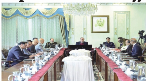
He also ordered to take special care of residence, travel and other facilities for the pilgrims. "Merit and transparency must be ensured in deployment of the Moavineen."

Hujjaj (pilgrims) during the upcoming Hajj. He instructed to prepare comprehensive briefing with respect to the preparation of Hajj 2025 and present it in coming days. He also directed to present a detailed briefing on the selection criteria of Moavineen Hajj (Hajj assistants), their responsibilities, their responsibilities and other arrangements. He said the best possible facility should be provided to the pilgrims, besides ensuring selection of capable officers having good reputation for Hajj duty.