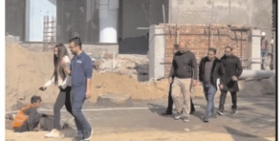
venue would be completed by January 30. The eight-team tournament, featuring 15 matches, will take place from February 19 to March 9 across three venues—Karachi, Lahore, and Rawalpindi in Pakistan and Dubai. A consists of Pakistan, India, New Zealand, and Bangladesh, while Group B features Afghanistan, South Africa, England, and Australia. The tournament opener will see hosts Pakistan face New Zealand on February 19 in Karachi.