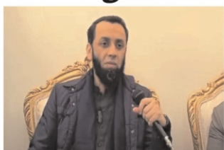
There is a need to hold more such tournaments that promotes healthy competition and sportsmanship, he said while reiterating the commitment of the government