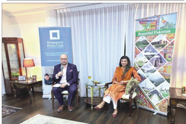
Pakistan High Commissioner to Singapore, Rabia Shafiq Interacting with Media in Singapore.

The airport's construction began in 2019, with an estimated cost of Rs50 billion (including a Chinese grant), and the project was completed in November 2024. The state-of-the-art airport can provide refueling and cargo services to over 50 airlines daily, marking a transformative step in enhancing connectivity and boosting the region's economic prospects.