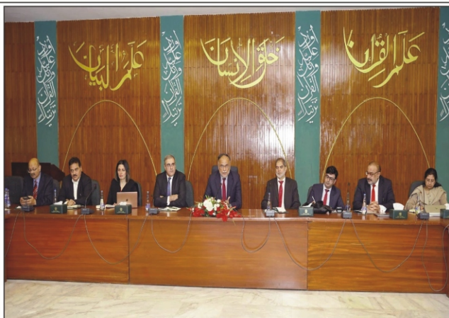
ISLAMABAD: Federal Minister for Planning, Development, and Special Initiatives, Ahsan Iqbal, chaired a consultative meeting on the Uraan Pakistan Action Plan with the representatives of Ministries, Provinces and Divisions.

He argued that this step was crucial for unlocking the potential of Pakistan's young population and driving sustainable economic growth.