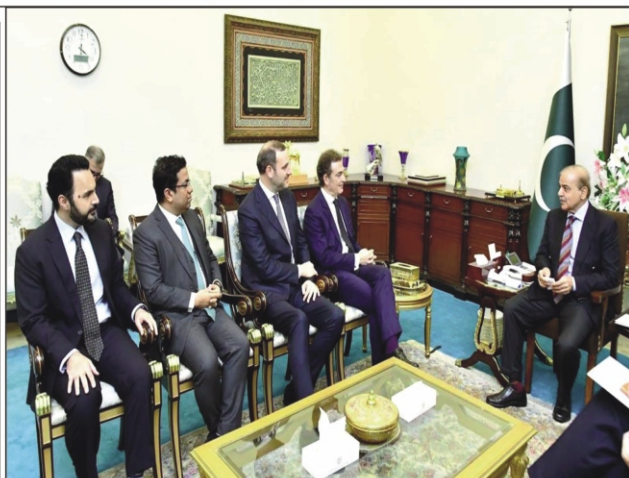
ISLAMABAD: A delegation of Rothschild and Co calls on Prime Minister Shehbaz Sharif.

The prime minister directed the authorities concerned to take effective measures to avert such incidents in the future. He prayed for the departed souls to rest in peace and for the grant of patience to the bereaved families.