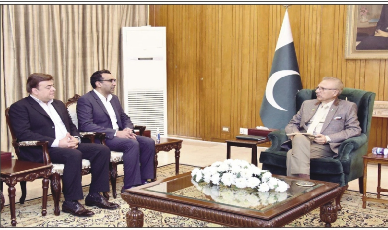
ISLAMABAD: President Dr Arif Alvi chairing a meeting regarding crop insurance at Aiwan-e-Sadr.

healthcare delivery to successfully meet the challenges in the health sector, besides fulfilling the future healthcare needs of the country. He underlined the need for establishing partnerships among government institutions, private organizations, and non-governmental organisations to work together for the betterment of persons with disabilities and raise awareness about breast cancer. The president appreciated the efforts of Siemens Healthineers for the development of Pakistan's healthcare.