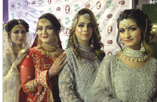
ISLAMABAD: Model pose for photo during Master Class Bridal Show in a local hotel.