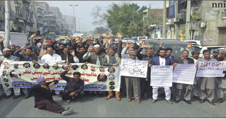
ISLAMABAD: Government Employees under banner of APCA stage a protest against rising inflation, imposition of additional tax through mini-budget, demanding increase in salaries as per rising price-hike here on Monday.