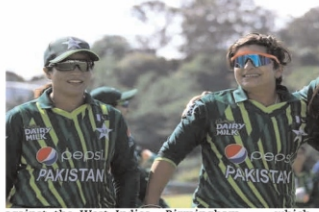
against the West Indies earlier in the month. She went wicketless in the first encounter against England in Birmingham, which Pakistan lost by 53 runs.

The Pakistan skipper and all-rounder was on 135 at the start of the game, having come close to the milestone in Pakistan's home series