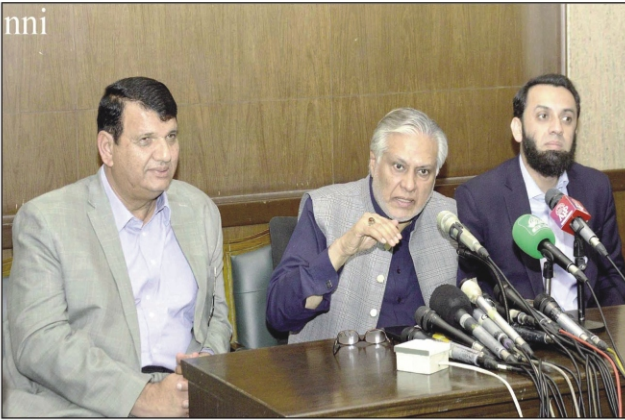
ISLAMABAD: Deputy PM Ishaq Dar, Federal Minister for MOIB Attaullah Tarar and Federal Minister for Kashmir Affairs, Ameer Muqam holding a press conference.

The PTI leader further said the Punjab CM might have some mental illness as he has been adorning the official uniforms one after the other.