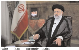
Iran's President Ebrahim Raisi and his foreign minister.

In Iran's dual political system, split between the clerical establishment and the government, it is the supreme leader rather than the president who has the final say on all major policies. But many see Raisi as a strong contender to succeed his 85-year-old mentor, Supreme Leader Ayatollah Ali Khamenei,