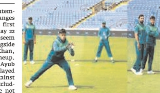
their combination for the upcoming ICC T20 World Cup2024, being co-hosted by the USA and the West Indies. A final decision will be made after consulting with head coach Gary Kirsten, who is set to join the Pakistan squad today. The four-

The team management is also considering dropping a pacer to create room for either Shadab Khan or Abrar Ahmed. Pakistan aims to field their full-strength team in the England series to test