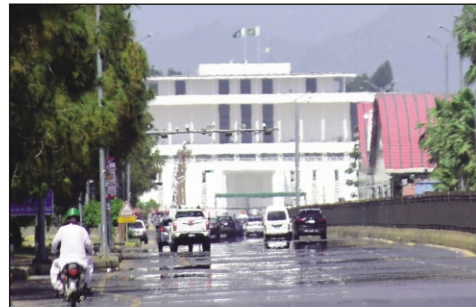
ISLAMABAD: Extremely hot weather creates mirage on Jinnah Avenue, its like water on the road, as move toward it, the "water" disappears. Sometimes label a mirage as an illusion or as a hallucination.

and Accreditation at the Punjab Food Authority said that the rise of non-communicable diseases (NCDs) in Pakistan has reached an alarming level. With six out of ten deaths in the country attributed to NCDs, and a significant three out of those six due to cardiovascular diseases, the need for immediate action is clear. The situation is particularly concerning among the youth, with the prevalence of overweight children under five nearly doubling between 2011 and 2018. Additionally, four out of ten adults in Pakistan are facing obesity. These statistics point to a dire need for changes in dietary habits and public health policies. As of February 2024, while 79 countries have enacted legislation or regulatory measures to eliminate ITFAs, Pakistan remains in a less restrictive category according to the WHO scorecard, having missed the 2023 deadline. This calls for a critical evaluation of the current food policies and regulatory frameworks in place. Ms. Ather recommended a shift from the manufacturing of partially hydrogenated fats to an interesterification process, a potential technological solution to this pressing health issue. The session aimed to assist SMEs in the food industry to understand the health risks associated with ITFA and explore viable alternatives for product reformulation, empowering SMEs to comply with national and international ITFA standards, ultimately contributing to a healthier food supply in Pakistan.