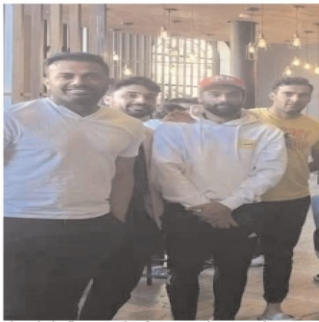
play their first match of the four match T20I series against England at the Headingley Cricket Ground on May 22.

Meanwhile, Pakistan men's cricket team will