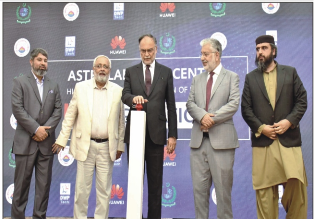
KARACHI: Federal Minister of Planning, Development & Special Initiatives Ahsan Iqbal Inauguration the Astrolabe Datacenter at NED University.

and how will we bring private sector investments and privatize it in knowledge and industry, he added. Ahsan Iqbal said that Pakistani universities have to become problem solvers, solution providers and a center of innovations that will give us all the possibilities for a bright future for the sustainable development. He said that Pakistan's universities have to lead, particularly, the engineering universities have to take the lead as the key to Pakistan's future is in the hands of engineering universities. He said that today United States is a superpower not on the strength of its weapons, not on the strength of its economy, if America is a superpower, then its universities are on the back of America.