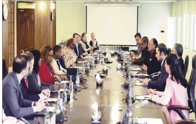
ISLAMABAD: Federal Minister for Finance & Revenue, Senator Muhammad Aurangzeb, meeting with the World Bank delegation to discuss Pakistan's economic outlook and reform agenda.

The recent passage of the Khyber Pakhtunkhwa Universities (Amendment) Act, 2024, on January 21, 2025, transferred the powers of the Chancellor from the Governor to the Chief Minister, granting direct authority over public universities. Given this legislative shift, civil society urges the Chief Minister to direct the Department of Higher Education to develop an online centralized monitoring and compliance system to track the implementation of the quota.