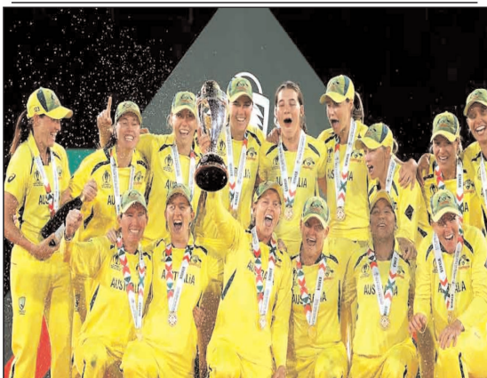
DUBAI: Record prize money revealed for ICC Women's Cricket World Cup at $13.88m.