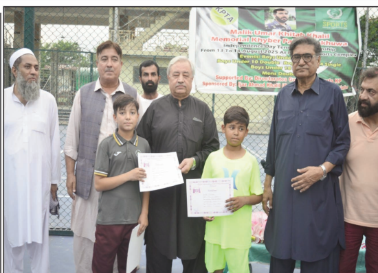
PESHAWAR: On the occasion of Umar Khetab Memorial Tennis Championship, chief guest distributes prizes among players here on Monday.