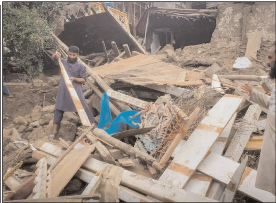
Afghan men search for their belongings amidst the rubble of a collapsed house after a deadly magnitude-6 earthquake that struck Afghanistan around midnight, in Dara Mazar, in Kunar province, Afghanistan.

Taliban-led health authorities in Kabul, however, said they were still confirming the official toll figure as they worked to reach remote areas. The US Geological Survey (USGS) recorded the earthquake at a magnitude of 6.2, with its epicenter located near Jalalabad in Nangarhar province as it took place at a depth of eight kilometers.