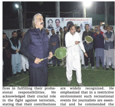
are widely recognized. He emphasized that in a restrictive environment such recreational events for journalists are essential and he commended the