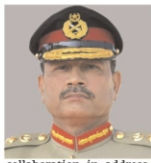
collaboration in addressing shared security challenges and fostering peace and stability in the region. The visiting dignitary lauded the professionalism of the Pakistan Armed Forces and commended their unwavering efforts in combating terrorism.

RAWALPINDI: General Sheikh Mohammed Bin Isa Bin Salman Al Khalifa, Commander of the National Guard of the Kingdom of Bahrain, called on General Syed Asim Munir, NI (M), Chief of Army Staff (COAS), at General Headquarters (GHQ). "During the meeting, both leaders engaged in discussions on matters of mutual interest, the regional security landscape, and avenues for strengthening bilateral military cooperation," said an ISPR news release. COAS underscored the significance of enhanced