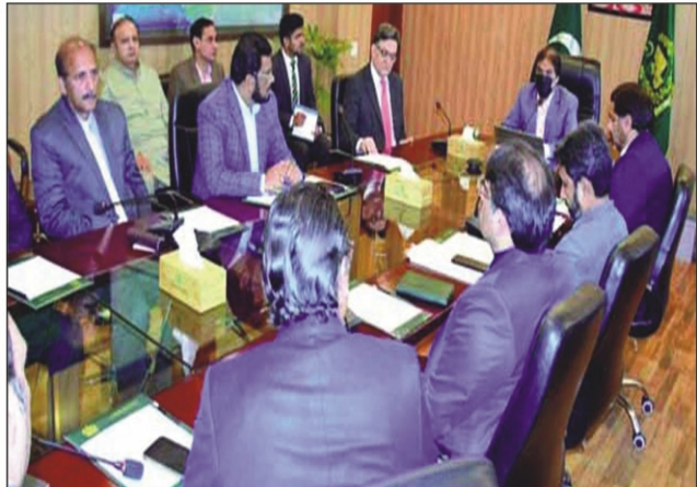
ISLAMABAD: Federal Minister for Railways, Muhammad Hanif Abbasi holds high level meeting at Ministry focuses on enhancing efficiency, passenger safety, and modernizing Pakistan Railways.

better communication with travellers, ensuring they were informed in advance about train timings, delays, and service interruptions. He also highlighted Pakistan Railways' economic potential, encouraging officials to explore new revenue streams through private-sector partnerships, improved freight services, and tourism development. The Minister said that Pakistan Railways could play a vital role in economic growth and social development due to its extensive network and rich history. Hanif Abbasi called for a renewed commitment from all stakeholders to transform Pakistan Railways into a modern, efficient, and reliable transport system that meets the needs of the people.