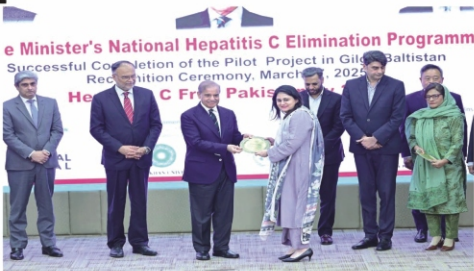
Minister, he resumed the program, which was now operational in Punjab under the leadership of Chief Minister Maryam Nawaz. "We see a bright future of Gilgit Baltistan and subsequently other parts of Pakistan," he said expressing the confidence that with the efforts of the incumbent government, Hepatitis C will be completely erased from the country very soon. This aggressive disease is spreading. This is high time to effectively control this disease," he said.

The prime minister expressed regret that