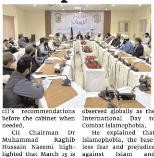
Minister Yousaf asserted noting that whenever a national issue arises, the nation looks towards the CII for guidance.

ing its misuse. "Anyone who intentionally commits blasphemous should be punished in accordance with legal principles, but no one should take the law into their own hands," Minister Yousaf asserted noting that whenever a national issue arises, the nation looks towards the CII for guidance. "Even if a prominent scholar expresses an opinion, it remains personal, whereas the council's recommendations represent a collective and institutional perspective," he added. The minister also assured his full support in presenting the coun-