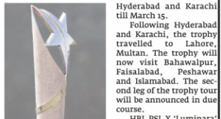
was displayed at various locations across

In the first leg of the trophy tour, the Trophy