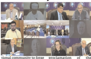
challenge demands collective action and innovative responses affirming OIC's commitment to effective strategies against Islamophobia, strengthening legal protections for minorities, and combating religious hatred through dialogue and mutual respect.