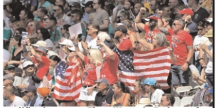
qualification. The expanded schedule reflects USA Rugby's commitment to growing the sport domestically and providing elite competition opportunities for its national teams. "This is a landmark year for USA Rugby," said USA Rugby CEO Bill Goren. "Bringing the Men's and

ISLAMABAD: USA Rugby and World Rugby have unveiled an ambitious home test series for 2025, bringing top-tier international rugby to fans across the United States. Supported by TEG Sport, the series features six matches over five weeks in four cities, making it the most extensive home schedule in recent history. The Women's Eagles will use the series to prepare for the Rugby World Cup in England, while the Men's Eagles will compete in the Pacific Nations Cup as part of their campaign for 2027 Rugby World Cup