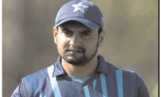
er and will be going to the National Cricket Academy for rehabilitation and training. "I'm working hard and hope to return to the Pakistan Super League this year," he said.