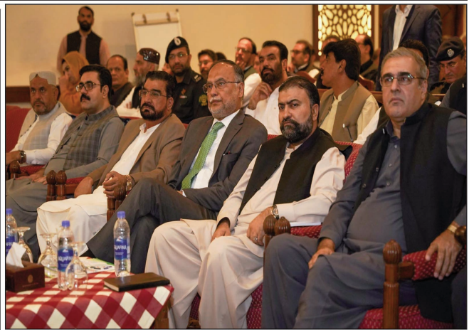
Federal Minister for Planning and Development Ahsan Iqbal, and Chief Minister Balochistan, Sarfaraz Bugti, attending the URAAN Pakistan Consultative Workshop in Quetta.

Highlighting past achievements, Iqbal recalled the progress made from 2013 to 2018, including the end of 16-hour electricity shortage, improved law and order, and the construction of hundreds of kilometers of roads in Balochistan. He said there was no proper road linking from Gwadar to Quetta in the past, "he said.