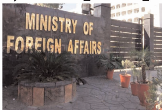
During the day-long holding delegation-level talks with the Acting Foreign Minister. The talks will cover the entire agenda of the Pak-Afghan relationship, focusing on ways and

Jammu and Kashmir, yesterday. India's arbitrary designation of the Indian Durgally Occupied Jammu and Kashmir as its so-called Union Territory is null and void, ipso facto." "Rather than making baseless claims, India should vacate the large territories of Jammu and Kashmir under its forcible occupation for the last 77 years," he continued. He said that at the invitation of Acting Afghan Foreign Minister, Deputy Prime Minister and Foreign Minister Senator Mohammad Ishaq Dar will lead a high-level delegation to Kabul on Saturday.