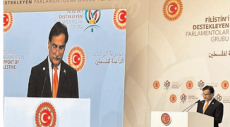
stance on Palestine is not to recognize Israel has been upheld by every successive government to date, he added. Speaker Sadiq has said that even as a nascent state, Pakistan took a firm stand—advocating for Palestine both nationally and globally. He further said that during his previous tenure as Speaker National Assembly, he had the honour of convening the first-ever Speakers' Conference in

Palestine, he said that for over seven decades, the people of Palestine have been denied their inalienable right to self-determination—a right enshrined in countless United Nations resolutions. He lamented that the international community has largely failed to stop the oppression, as Palestinians continue to suffer under a brutal and illegal occupation. While expressing unwavering solidarity with the people of Palestine, Speaker Sardar Ayaz Sadiq has said that Pakistan stands with the people of Palestine in their just and noble struggle. This support is not episodic—it is principled, historic, and central to our foreign policy, he added. Pakistani travel guides.