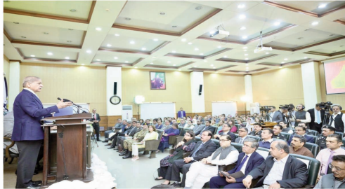
Prime Minister Shehbaz Sharif (left) addressing a group of officials at the FBR. He also visited the newly established delivery unit of FBR and interacted with officers. The prime minister was informed that a data-driven decision-making system was being introduced at the

He said the FBR revenues witnessed an increase of 27% for which the entire FBR team deserved appreciation. However, he said this was a long journey and more work was needed to plug the loopholes in the system. The prime minister commended the efforts of the finance minister, secretary finance, Chairman FBR and the entire team for launching such an effective performance system. He also announced to replicate the implementation of his government institutions to promote the culture of penalty and reward aimed at improving the performance of the institutions. During his visit to the FBR, the prime minister was briefed on PRAL (Pakistan Revenue Automation Limited), digital invoicing, and the newly launched Performance Management System. He also visited the newly established delivery unit of FBR and interacted with officers. The prime