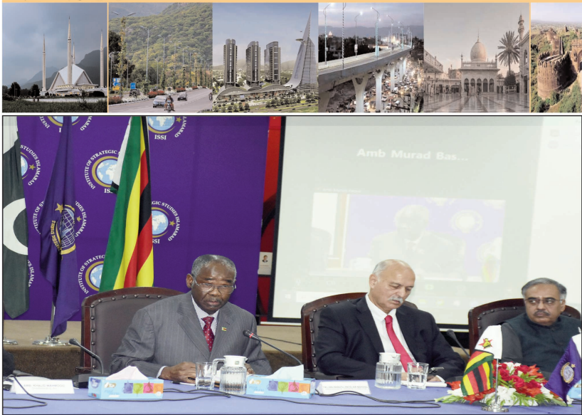
ISLAMABAD: President Pakistan People's Party Human Rights Cell and former senator Farhat Ullah Babar addressing a press conference, in the Federal Capital.