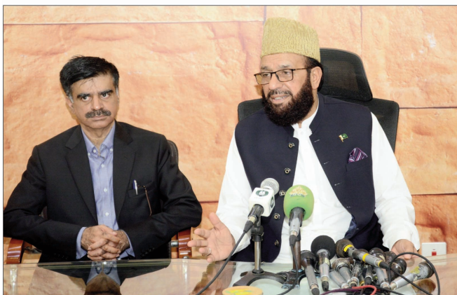
KARACHI: Federal Minister for Religious Affairs and Interfaith Harmony Sardar Muhammad Yousaf briefing the media at Hajj Camp.

since April 1 as part of the ongoing national policy to return individuals residing in Pakistan illegally. He clarified that the repatriation process is being conducted in a lawful, organized, and humane manner, and that Pakistani authorities are working closely with Afghan counterparts to facilitate the transition. A major part of the government's enforcement strategy focuses on those providing accommodation, employment, or services to undocumented foreigners. Talal Chaudhry revealed that strict action will be taken against Pakistani citizens who rent out shops, homes, or hotel rooms to illegal immigrants, or hire them for jobs. "We have communicated clear instructions to all provinces, if anyone gives a shop, house, or any kind of space to an illegal foreigner, they will be held accountable under the law," he said.