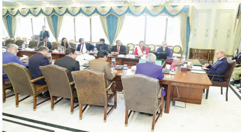
Improve the competition of Pakistan's manpower at international level. The government will encourage the ACCA's efforts to enhance the capacity of

youth and capable manpower. He noted that the third party validation to improve transparency and governance was the basic part of the every government project. He said that bringing improvements in the government's performance and governance was top priority of the government. "Improvement in Pakistan's investment rating by Fitch is a welcoming sign but we have to make further efforts," the prime minister said adding that the association could play an important role in imparting new professional skills to