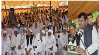
reservoirs have made Pakistan an ideal investment destination and urged the investors to take advantage of the Govt pro-mineral policies. Through investment, he said that mines and mineral rich areas would be largely benefited besides ensuring employment opportunities for the area's people. He said that the Prime Minister has provided a significant relief to domestic and industrial consumers after

Muhammad Shehbaz Sharif has announced a historic relief package for overseas Pakistan that would greatly help bringing direct foreign investment in Pakistan. He said that Pakistan especially Khyber Pakhtunkhwa was blessed with abundance of mines, gemstones, marble, granite and mineral resources and its exploration on scientific level would be used on the country's fast track development. Engr Amir Muqam who is also the provincial President of PMLN KP said that mines and mineral besides gemstones