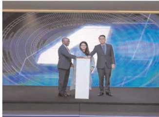
ment to bridging the digital divide and ensuring that no community is left behind." She also mentioned the importance of implementing the 5G and technology parks to drive innovation and growth within the country. She said that technology is now being utilized

tiative to address the rural-urban digital divide in Pakistan. The Smart Village Swabi aims to serve as a model for the digital transformation of rural communities, particularly of women and farmers through comprehensive digital skills training programs covering a range of areas from basic digital skills to online marketing, e-commerce, digital financial inclusion, and digital agriculture etc. On the occasion Federal Minister for IT and Telecommunication Shaza Fatima Khawaja expressed her enthusiasm for the project, stating, "The Swabi Smart Village Project represents a major milestone in our journey towards achieving a digitally empowered Pakistan. This initiative underscores our commit-