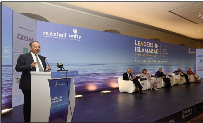
ISLAMABAD: Federal Minister for Climate Change and Environment, Senator Dr. Mussadiq Malik, addressing the leaders in Islamabad Business Summit.

Asserting Pakistan's commitment to environmental sustainability, the Minister declared, "We are going green not because of external conditions, but for the future of our generations. Whether we receive support or not, we will make it happen and improve the environment."