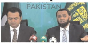
the court. tactics in court cases.

The minister said that the verdict on 190 million pound case was supposed to be given today, but the accused fail to appear in