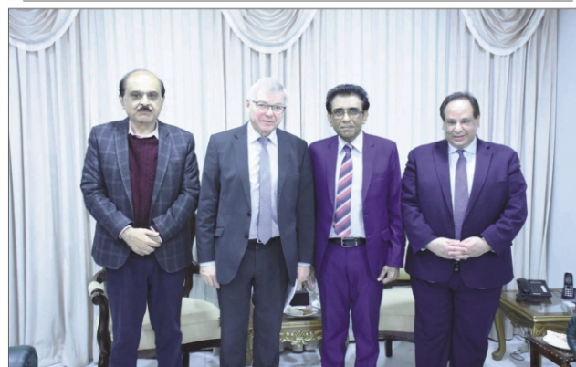
ISLAMABAD: Federal Minister for Education and Professional Training, Khalid Maqbool Siddiqui met with a high powered delegation led by the former Prime Minister of Norway Mr Kjell Magne Bondevik.

He further stated that the negotiations and this case were not related to each other, adding that there was an impression being created that a deal was being brokered.