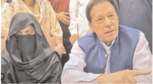
The judge waited for them until 10:30 am and later it was announced that the announcement of the verdict has been delayed once again which will now be pronounced on January 17. The judge then left the Adiala Jail after announcing the fresh deferment.