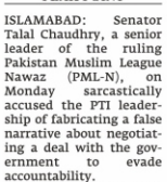
clearly implicated the PTI founder and his spouse, who are employing delaying tactics to evade accountability. He pointed out the contradiction between the PTI founder's ambition to establish a "Riasat-e-Madina" and the corruption accusations against him, particularly regarding his appropriation of entire Toshakhana gifts.

Speaking to the media alongside the Minister for Information, Broadcasting, Heritage and Culture, Attaullah Tarar, Chaudhry emphasized that no leniency would be granted to those involved in the £190 million corruption scandal. He stated that the case