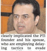
wrongdoing while presenting himself as a proponent of Islamic values, yet his actions resemble those of Yazeed.

Additionally, PTI government has been accused of misusing state resources and donating a portion to charity to create a false image of generosity, raising doubts about the authenticity of PTI leadership.