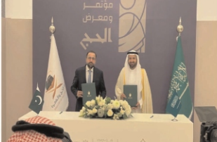
Minister for Religious Affairs and Interfaith Harmony Chaudhry Salik Hussain and Saudi Minister of Haj and Umrah Dr Tawfiq Bin Fawzan Al-Rabiah on Monday signed the annual Hajj agreement between the two countries.