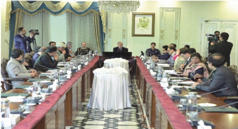
The prime minister directed the Ministry of Information Technology