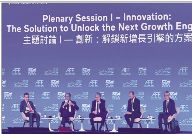
HONG KONG: Finance Minister of Pakistan, H.E. Senator Muhammad Aurangzeb, delivering a keynote speech at the Asian Financial Forum 2025.

Aurangzeb predicted that the nation's GDP would likely expand by 3.5 percent in the fiscal year ending June 30, compared to a 2.5 percent expansion in the prior financial year, with a 3.6 percent economic growth target set for the upcoming year. In response to a question, Aurangzeb said Pakistan was preparing to debut Yuan-denominated bonds this year to strengthen its finances, while the government remained optimistic about meeting the International Monetary Fund's (IMF) bailout loan conditions.