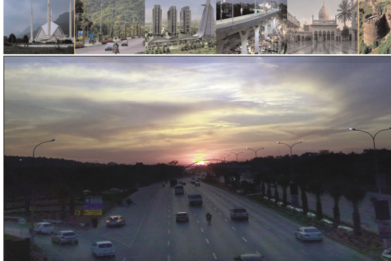
ISLAMABAD: Motorists on their way at Srinagar Highway during stunning view of sunset, in the Federal Capital.