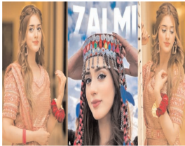
Jannat Mirza appointed as Peshawar Zalmi's social media ambassador for PSL 10