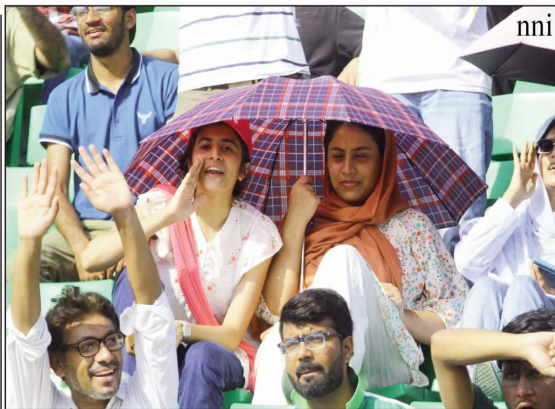
LAHORE: Spectators watch first test match between Pakistan and South Africa in Gaddafi Stadium here on Sunday.