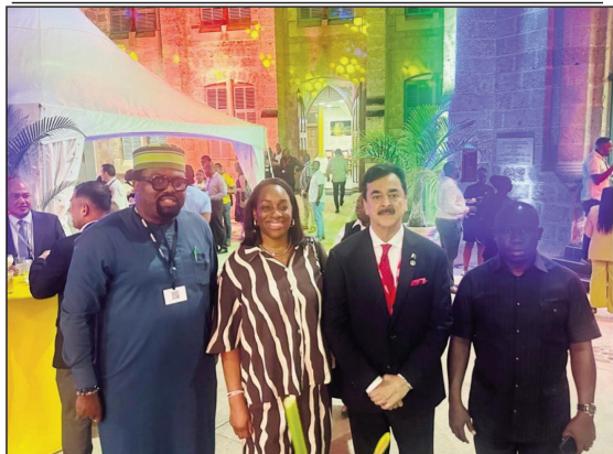
Chairman Senate of Pakistan Syed Yousaf Raza Gillani in a group photo with participants of 68th Commonwealth Parliamentary Conference in Barbados.

The ongoing reforms are being implemented under the National Biometric and Registration Policy Framework, which was approved by the Prime Minister on January 1 this year. The framework aims to establish a unified, technology-driven mechanism for the timely recording of vital events.