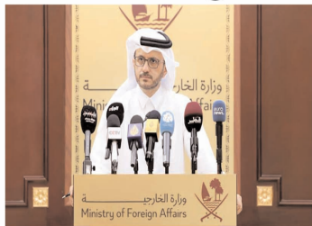
Afghanistan can have a negative impact in the region.

The Ministry of Foreign Affairs of Qatar has said the reduction of tension is inevitable for peace and stability in the region, adding tension between Pakistan and