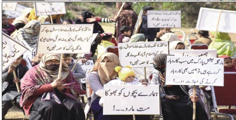
ISLAMABAD: Family members of employees of old Munal restaurant hold placards during protest in favor of their demands at Pir Sohawa, in the Federal Capital.