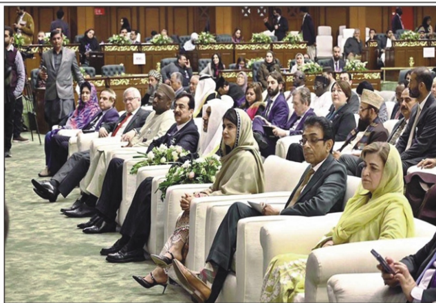
ISLAMABAD: Minister for Federal Education and Professional Training Dr Khalid Maqbool Siddiqui, Chairman Senate Syed Yousaf Raza Gilani and Malala Yousofzai at the closing ceremony of the International Conference for Girls' Education.

Gilani also highlighted the contributions of Former Prime Minister Zulfikar Ali Bhutto and first women Prime Minister of the Muslim world Benazir Bhutto for women's education and their endeavors for bringing gender equality, social empowerment, and political participation for women in Pakistan.