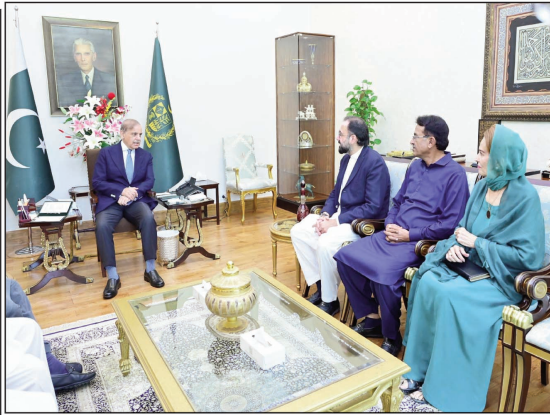
ISLAMABAD: A delegation of MNAs from PML-Q led by Federal Minister for Overseas Pakistanis and Human Resources Development Chaudhry Salik Hussain called on Prime Minister Muhammad Shehbaz Sharif.

They also lauded the prime minister's exemplary leadership during the recent tensions with India and his efforts to elevate the country's prestige at the global stage. Matters related to the respective constituencies were also discussed during the meeting.