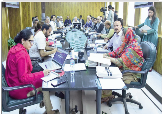
ISLAMABAD: Federal Minister for National Food Security & Research, Rana Tanveer Hussain, chairs the 3rd Board of Governors meeting of NSDRA at MNFSR, emphasizing quality seed provision and sectoral reforms.

The minister reaffirmed that NSDRA will be developed into a modern, efficient, and transparent regulatory body that will play a key role in steering Pakistan toward agricultural self-sufficiency. The government considers the welfare of farmers and the provision of quality seed as a vital pillar of national development.