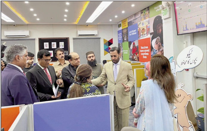
ISLAMABAD: Federal Minister for National Health Services, Regulations & Coordination, Syed Mustafa Kamal visited Federal Directorate of Immunization.