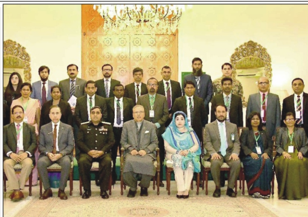
ISLAMABAD: President Dr Arif Alvi in a group photo with senior Civil Servants from Sri Lanka who are attending a two-week training programme at National Defence University, at Aiwan-e-Sadr.

technology (IT) sector. He said the intellectual edge made nations great, and countries should focus on developing knowledge economies and investing in the intellectual development of their people. He stated that developing countries could achieve accelerated economic growth by focusing on the development of the IT sector and adopting conducive business policies. The president also highlighted the need to become more financially disciplined to overcome perennial financial issues of developing countries. He added that common people alone could not be burdened again and again to bear the brunt of bad economic decisions and the elites must also share the burden for the greater good of the country.