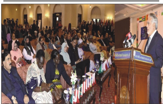
ISLAMABAD: Federal Finance Minister Senator Mohammad Ishaq Dar addressing the "Road Safety Conference for Parliamentarians, a global perspective, Pakistan-2023".

ors to defer the elections in Punjab and Khyber Pakhtunkhwa beyond the 90-day period allowed by the Constitution, Article 6 of the Constitution will be applicable on them. He said that President Arif Alvi in letter has asked the Election Commission of Pakistan (ECP) to immediately announce the date of elections for provincial assemblies of Khyber Pakhtunkhwa and Punjab.