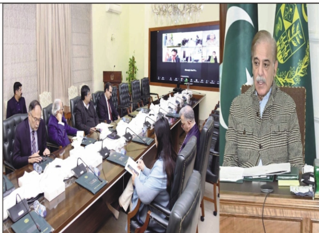
ISLAMABAD: Prime Minister Shehbaz Sharif chairs a meeting to review Pakistan's contribution in rescue and relief activities in the post-earthquake situation in Turkey and Syria.

said Turkey extended support to the people of Pakistan after floods in 2010 and 2022. Prime Minister Shehbaz also instructed the authorities concerned to arrange blankets, warm clothes, baby food and tents while ensuring the quality of the relief goods being sent to Turkey and Syria. The prime minister said that despite limited resources, Pakistan would leave no stone unturned in supporting their Turkish brethren. He said that Pakistan established an air corridor to supply relief goods and a convoy of trucks would soon leave for Turkey and Syria. The meeting was told that a team along with the equipment for a 30-bed mobile hospital was already serving in Turkey while another mobile hospital was being dispatched along with staff and equipment.