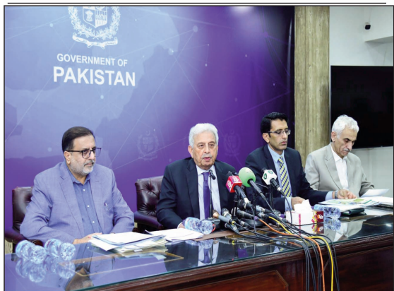
ISLAMABAD: Federal Minister Rana Tanveer Hussain addressing a press conference on sugar supply and trade policy.