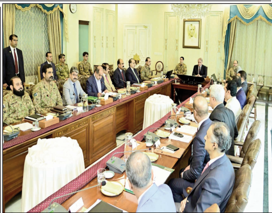
ISLAMABAD: Prime Minister Muhammad Shehbaz Sharif chairs a meeting of the steering committee on Anti-Terrorism and Harden the State.