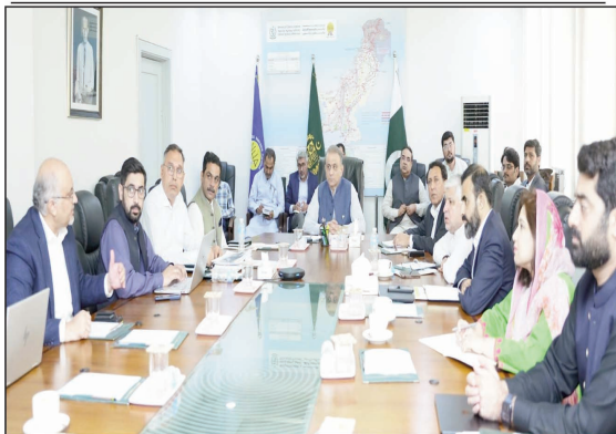
ISLAMABAD: Federal Minister for Communication Abdul Aleem Khan chairing an important meeting regarding Mansehra-Naran-Jhalkand-Chilas Motorway (MNJC), a key NHA project.

Babusar Top, while the second phase will cover the section from Babusar Top to Chilas. A major highlight of the project is the construction of the 13.5km-long Babusar Tunnel, which will be the longest tunnel in Pakistan. Designed with future demand in mind, the four-lane motorway will have the capacity to expand to six lanes. Modern rest areas will be built every 25-30km for motorists, and freight terminals will be established at both ends of the motorway. Highlighting the economic significance of the project, the minister said that traditionally, trade from the Arabian Sea to China via existing routes was time-consuming and resulted in significant financial costs. The new motorway would directly link western China to the ports of Karachi and Gwadar, the minister added. He said the network would serve as the fastest, shortest, and most cost-effective route from the Arabian Sea to western China, drastically reducing transit times and costs while proving to be a "real game-changer" for the sustainable development of Gwadar Port.