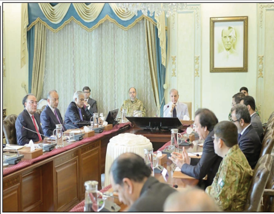
ISLAMABAD: Prime Minister Muhammad Shehbaz Sharif chairs progress review meeting on sectoral reforms.

saying that long-term economic policies must remain focused on public welfare and national prosperity. He emphasized that effective policy interventions to increase domestic production and expand exports were among the government's key priorities. "Industrial products must contribute not only to increased local manufacturing but also to higher export volumes," he said. The prime minister directed that reforms across the industrial, commercial and economic sectors should be designed with a focus on long-term economic benefits and public welfare. He also highlighted the government's efforts to formulate a comprehensive strategy for meeting future energy requirements through alternative and renewable energy sources. Addressing the transportation.