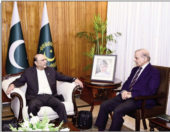
ISLAMABAD: President Asif Ali Zardari talking to Prime Minister Muhammad Shehbaz Sharif at Aiwan-e-Sadr.

It added that the president directed that every effort should be made to harmonise the growth rate with public welfare schemes in the upcoming budget. National security, as well as the internal and regional situation, were also discussed. The Presidency said Interior Minister Mohsin Naqvi briefed the president on his recent visit to Iran and regional diplomatic engagements. Apart from the federal budget and national security, the meeting also discussed the economy, the recent Gilgit-Baltistan elections, the situation in Azad Jammu and Kashmir, law and order, and other matters of national importance, the handout said. Deputy Prime Minister and Foreign Minister.