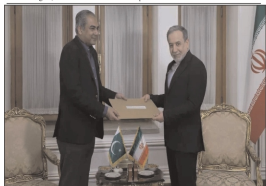
Interior Minister Mohsin Naqvi (left) delivers message to Iran's Supreme Leader Mojtaba Khamenei during a meeting with Iranian Foreign Minister Abbas Araghchi in Tehran.

Syed Yousaf Raza Gilani stressed that the protection of oceans is essential not only for environmental sustainability but also for economic resilience, particularly in sectors linked to fisheries, trade.