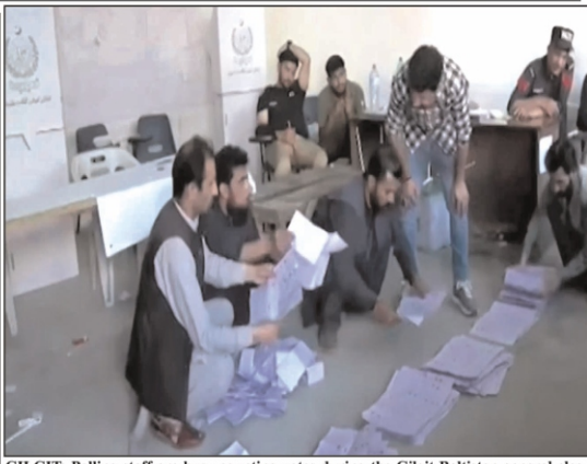
GILGIT: Polling staff are busy counting votes during the Gilgit-Baltistan general elections