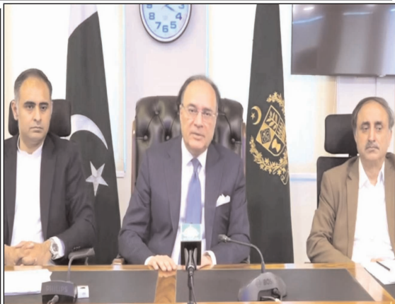
ISLAMABAD: Finance Minister Muhammad Aurangzeb (centre) speaks during a joint press conference with Minister of State for Finance Bilal Azhar Kayani.

"With Holding Tax (WHT), which is already deducted, will be adjusted in this tax," said the state minister. "However, at the time of form submission, the retailer will have to pay at least Rs25,000," he added.