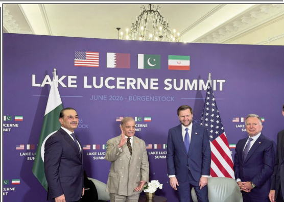
Prime Minister Muhammad Shehbaz Sharif and COAS & CDF Field Marshal Syed Asim Munir meeting with Vice President of the United States J.D Vance and the US delegation on the sidelines of US-Iran technical level talks as a follow-up of Islamabad MoU being held in Burgenstock, Switzerland.

US Vice President JD Vance told the press that "peace requires give and take". "This is a historic meet. Never before have Iranian and American leadership met at such a high level outside of Islamabad," he said. Thanking US President Donald Trump "for empowering us to find a diplomatic solution", Vance said a great deal had "already been accomplished" and the team looked forward to seeing "how much more we can accomplish together". "Can we change relations in the Middle East, or do we go back to doing things the old way?" he said. "Where Iran and the Gulf have had an unfriendly relationship, or Iran has been a driver of regional instability, we see a future where everyone can work together to promote peace and prosperity for everyone."