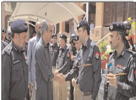
PESHAWAR: Federal Interior Minister Mohsin Naqvi on Thursday visited the Khyber Pakhtunkhwa Police Headquarters in Peshawar.

Addressing the meeting, Mohsin Naqvi said that the Khyber Pakhtunkhwa Police remains on the frontline in the fight against terrorism. He emphasized that modern weapons, technology, and equipment are being provided to the police force on a priority basis to strengthen its operational capabilities. He further said that the federal and provincial governments are jointly mobilizing all available resources to enhance the capacity of the KP Police and the CTD, and this support will continue in the future. The interior minister also assured that the federal government would provide full assistance in delivering advanced counterterrorism training to police and CTD personnel. Mohsin Naqvi praised the Khyber Pakhtunkhwa.