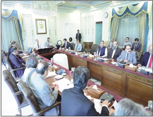
ISLAMABAD: Prime Minister Muhammad Shehbaz Sharif chairs a meeting regarding Pakistan Railways.

He noted that an improved railway system would help reduce traffic pressure on roads, lower transportation costs and promote environmentally sustainable mobility by reducing carbon emissions.