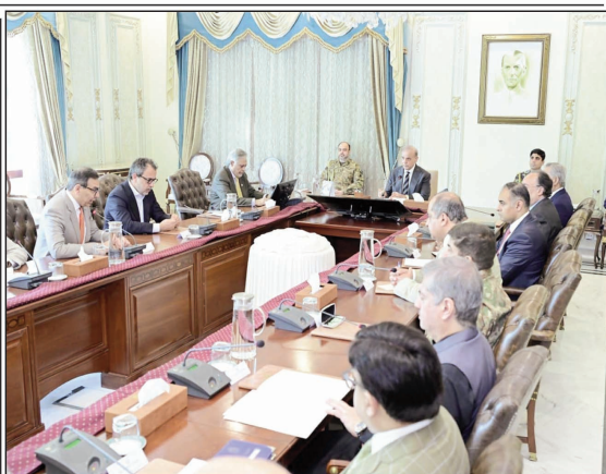
ISLAMABAD: Prime Minister Muhammad Shehbaz Sharif chairs a review meeting on privatisation of DISCOs.

The international roadshows are being organized starting this month to attract investors from Saudi Arabia, Turkiye, and China. The meeting was attended by Deputy Prime Minister and Foreign Minister Ishaq Dar, federal ministers Azam Nazeer Tarar.