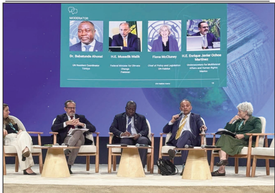
BAKU, AZERBAIJAN: Federal Minister for Climate Change and Environmental Coordination, Dr Musadik Malik, participated in the Thirteenth Session of the World Urban Forum (WUF-13) being held in Baku, Azerbaijan.

The minister said a significant share of vaccine financing was presently being covered.