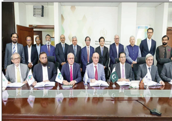
ISLAMABAD: Federal Minister for Petroleum Mr Ali Pervaiz Malik witnessed the signing ceremony of Production sharing agreements (PSAs) and Exploration Licences (ELs) for offshore exploration blocks awarded under the offshore Bid Round 2025.

Speaking at the ceremony, Federal Minister for Petroleum Ali Pervaiz Malik termed the signing a defining milestone in the Government's efforts to revitalise offshore exploration, attract both foreign and domestic investment, and reduce reliance on imported energy. He added that the agreements reflect strong investor confidence in Pakistan's offshore upstream potential, a frontier spanning 282,623 square kilometres, where only 18 exploratory wells have been drilled since independence. The Minister further highlighted that the successful completion of the offshore bid round reflects.