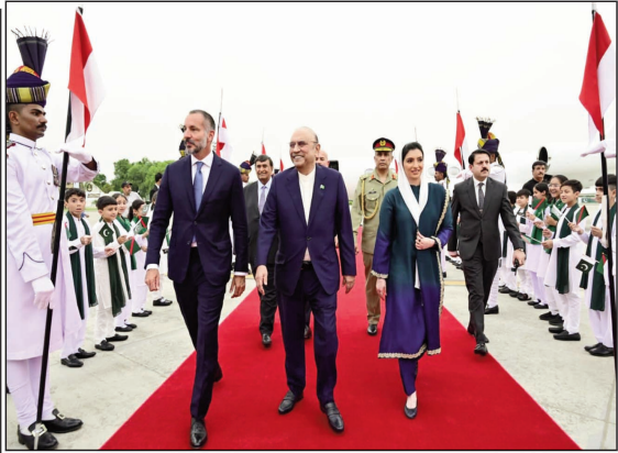
ISLAMABAD: President Asif Ali Zardari and First Lady Bibi Aseefa Bhutto Zardari receiving Prince Rahim Aga Khan V upon his arrival at Nur Khan Airbase.