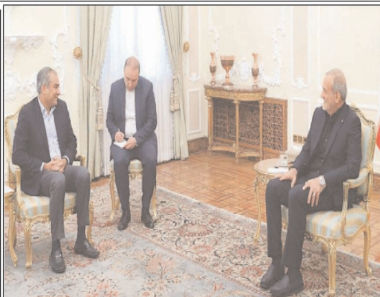
TEHRAN: Interior Minister Mohsin Naqvi has met Iranian President Masoud Peshkeshian at the Presidential Palace in Tehran on Sunday.

At the provincial level, he said, the District Human Rights Committees have also been established to promote social harmony at the grassroots level.