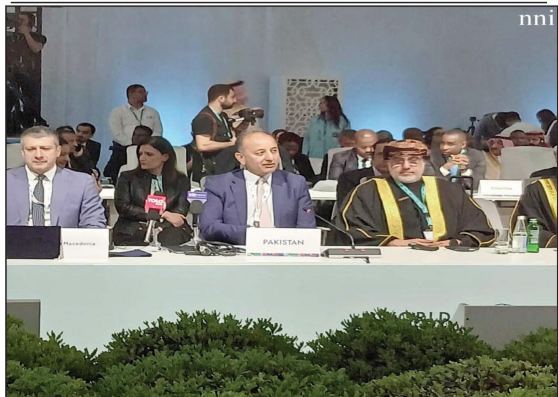
Federal Minister for Climate Change and Environmental Coordination, Dr Musadik Malik delivered Pakistan's National Ministerial Statement at the Thirteenth Session of the World Urban Forum (WUF13) being held in Baku, Azerbaijan.

adding that such disasters trap vulnerable families in cycles of poverty that may take generations to escape. Calling for urgent global action, the minister said the housing crisis facing developing countries should be viewed through the lens of justice rather than charity. "This is not a housing crisis; this is a crisis of justice," he told delegates at the forum. The minister said Pakistan's rapidly growing urban population was becoming increasingly exposed to climate shocks, with nearly half of the country's 240 million people now living in cities. Of those, he said, around 55 million people were living in slums under inadequate housing and crumbling civic infrastructure. "Slums are not a policy category; slums are a life category. Real people live in these slums," he said. Describing the living conditions faced by low-income families, Malik spoke of households of six to eight people sharing two-room homes without reliable electricity, sanitation or safe access to schools and healthcare facilities.