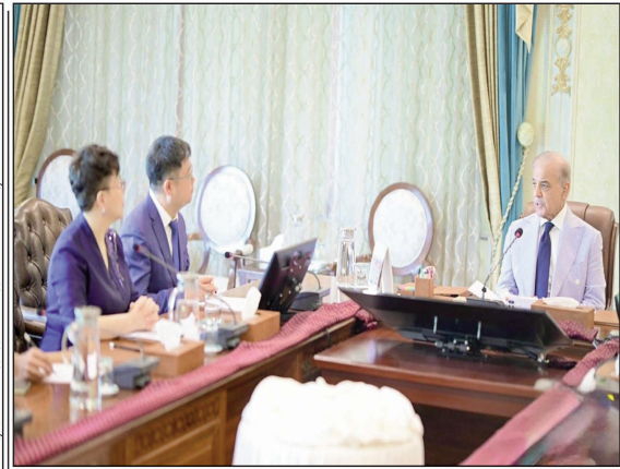
ISLAMABAD: A Chinese business delegation of IBI Beijing United Technology called on Prime Minister Muhammad Shehbaz Sharif.