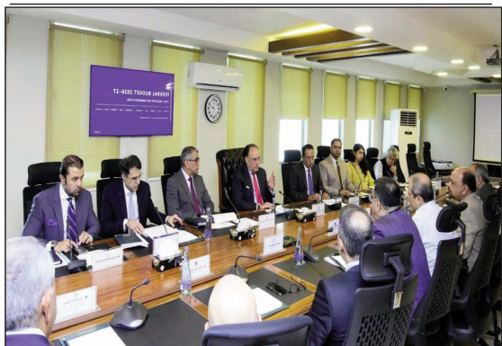
ISLAMABAD: Federal Minister for Finance and Revenue Senator Muhammad Aurangzeb holding a meeting with a high-level delegation representing Pakistan's textile and apparel sector, comprising leading chambers, association, exporters and industry stakeholders from across the country, at the Finance Division.

education sectors. She said a campaign titled "No Child Left Behind" had been launched in the Islamabad Capital Territory (ICT) in collaboration with the Ministry of Federal Education and Professional Training, the National Commission for Human Development (NCHD), Basic Education Community Schools, and several non-governmental organizations.