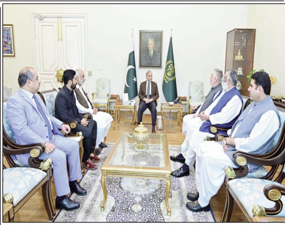
ISLAMABAD: A delegation of senior politicians from Balochistan called on Prime Minister Muhammad Shehbaz Sharif.

PEAK POINT ISLAMABAD: Prime Minister Shehbaz Sharif on Tuesday reiterated that the development, prosperity and welfare of the people of Balochistan remained the federal government's top priority. The prime minister expressed these views during a meeting with a delegation of senior politicians and members of the Senate from Balochistan at the Prime Minister's Office, a news release said. During the meeting, Prime Minister Shehbaz Sharif said that Balochistan was rich in natural resources and emphasized that the government was making every possible effort to ensure that the people of the province fully benefited from those resources. He said the federal government, in collaboration with the provincial government, was actively working for the progress and uplift of Balochistan and undertaking measures aimed at improving the living standards of its people. The delegation included Senator Mir Dostain Khan Domki, Balochistan Provincial Minister for Public Health Engineering Sardar Abdul Rehman Khetran, Member of the Balochistan Assembly Sardar Changez Marri, and Mir Khuda Bakhsh Marri. The participants also discussed matters relating to the overall development of the province and the welfare of the people of Balochistan.