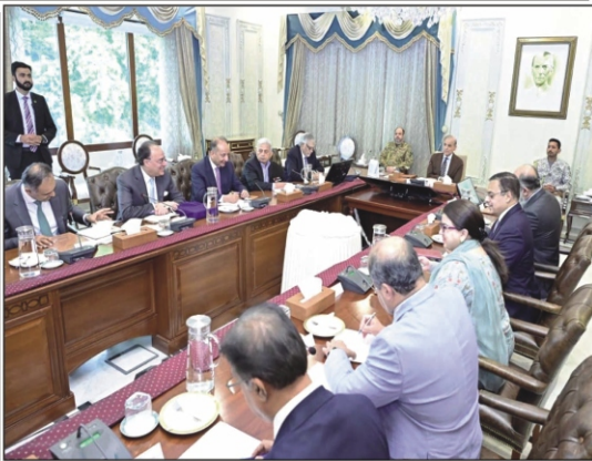
ISLAMABAD: Prime Minister Muhammad Shehbaz Sharif chairs a meeting on strategy to increase exports of the country.

He said that cooperation from provincial and district-level governments should be sought to reduce the digital gap between urban and rural areas in the IT sector. During the briefing on various initiatives for the promotion of IT, it was told that a recent 5G services auction was held in Pakistan, marking the world's largest such auction since 2016, generating $509 million in revenue for the country. Besides, the "Indus AI Week" was organised in February 2025 to promote Artificial Intelligence, featuring events across 30 cities, participated by over 100 international.