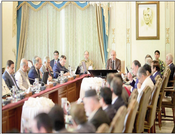
ISLAMABAD: Prime Minister Muhammad Shehbaz Sharif chairs the meeting of the Federal Cabinet.

The prime minister said Pakistan has repaid $3.5 billion in external debt and expressed gratitude for the support of the Saudi leadership in helping the country.