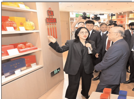
CHANGSHA, CHINA: President Asif Ali Zardari visiting the history gallery of Hunan Tea Group and observing exhibits on the development of the tea industry.

He expressed the confidence that the EO-3 satellite would open new avenues for advanced research, innovation and development in the country, helping Pakistan move forward in science and technology.