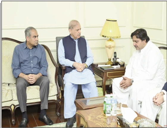
LAHORE: Prime Minister Muhammad Shehbaz Sharif offers condolence over the demise of sister of Speaker of the Punjab Assembly.

Both leaders agreed to maintain close coordination on regional matters and continue working together for peace and stability.