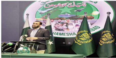
ed with such events.

The minister said that the prime minister, while speaking to cadets at PMA Kakul on April 26, 2025, had clearly articulated Pakistan's stance on the Pahalgam incident, rejecting baseless allegations and calling for an end to the blame game associat-