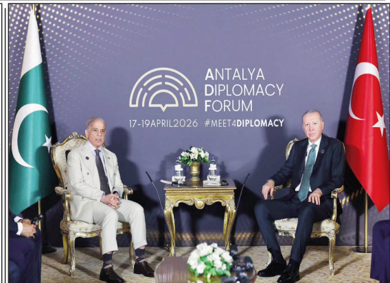
Prime Minister Muhammad Shehbaz Sharif held a bilateral meeting with President Recep Tayyip Erdogan of Türkiye on the sidelines of the 5th Antalya Diplomacy Forum in Antalya.

He congratulated the Turkish president on the success of the Antalya Diplomacy Forum, which he said had transformed into an important global event.