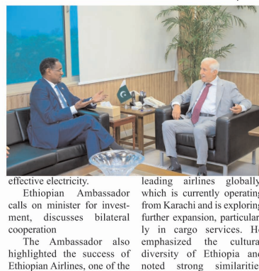
effective electricity. Ethiopian Ambassador calls on minister for investment, discusses bilateral cooperation. The Ambassador also highlighted the success of Ethiopian Airlines, one of the