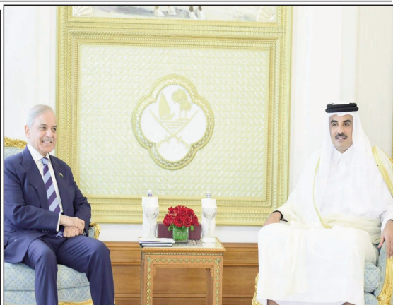
Prime Minister Muhammad Shehbaz Sharif meets Amir of Qatar, H.H Sheikh Bin Hamad Al Thani in Doha.

The prime minister said he thanked Sheikh Tamim on behalf of the people of Pakistan for the "exceptionally warm and generous gesture of sending Qatar's fighter jets to escort our aircraft."