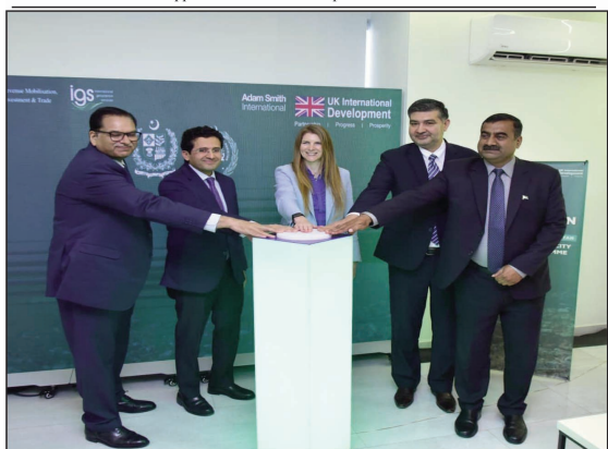
ISLAMABAD: Federal Minister for Petroleum Ali Pervaiz Malik jointly launched, along with British High Commissioner to Pakistan H.E. Jane Marriott at GSP.

timing of the initiative was particularly appropriate. He said that recent geopolitical developments and conflicts have once again exposed the vulnerabilities associated with excessive dependence on hydrocarbons. He emphasised that strengthening institutions such as the GSP is essential to position Pakistan as an attractive destination for mineral exploration and investment, especially in view of the growing global demand for minerals. He reiterated the government's commitment to developing the mineral sector in a sustainable, transparent, and investor-friendly manner. The Minister appreciated the support of the British High Commission and the UK Foreign, Commonwealth and Development Office (FCDO), and acknowledged the High Commissioner's personal engagement in advancing the collaboration. He welcomed greater participation of international partners, particularly from the United Kingdom, across various segments of Pakistan's mineral value chain. He added that the programme launched at GSP would help equip Pakistani scientists with modern tools, improve workflows.