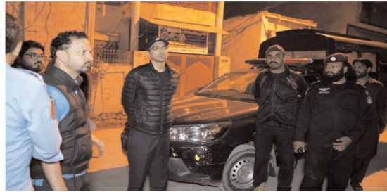
also participated in the operations to ensure effective checking. During the operations, a total of 901 individuals and 323 households were