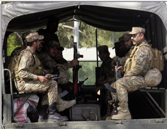
Pak-Army Troops patrolling in capital city to ensure security ahead of the United States and Iran possible negotiations in Pakistan's capital, in Islamabad.

The price of kerosene has been reduced by Rs17.33 per litre to Rs450.15, while light diesel oil has been cut by Rs25.31 to Rs369.72. Citing a slight decline in global oil prices, the prime minister said he rejected a proposal to divert fuel price relief towards government expenditure and insisted that the full benefit be passed on to the public. He reiterated that providing relief to farmers and reducing input costs remained a key priority of his government, particularly at a time when agricultural productivity and affordability were under pressure.