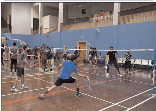
SARGODHA: Badminton players in action during the Ramadan Night Sports Festival at the Sports Gymnasium, organized by the Sports Department on instructions of Deputy Commissioner Hussain Ahmed Raza.

be honoured during matches of the upcoming PSL season. Shortlisted individuals will receive cash awards, while short documentaries highlighting their achievements and life stories will be shown during match broadcasts and across the league's digital platforms.