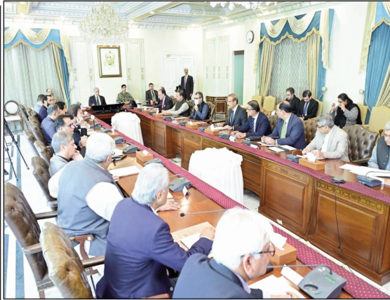
ISLAMABAD: Prime Minister Muhammad Shehbaz Sharif chairs a meeting regarding petroleum products.

creating an artificial shortage through hoarding should be immediately sealed, its licence cancelled, and legal action initiated against those responsible. He also instructed the Petroleum Minister to visit the provinces and, in coordination with provincial governments, prepare a comprehensive strategy and planning to ensure conservation of petroleum products and their uninterrupted supply to the public. The prime minister further directed that a dashboard be developed to monitor the movement of petroleum products so that real-time data could be shared with the provinces and transportation of fuel could be effectively monitored. The meeting was attended by Deputy Prime Minister Ishaq Dar.