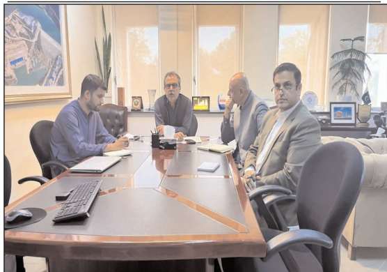
ISLAMABAD: Federal Minister for Energy (Power Division) Sardar Awais Ahmed Khan Leghari on Friday held a virtual meeting with Türkiye's Minister for Energy and Natural Resources, Alparslan Bayraktar.

The minister highlighted that Turkish companies, given their strong track record and extensive experience in the energy sector, could play a constructive role in the successful privatization of Pakistan's distribution companies. He also appreciated the ongoing engagement between the relevant institutions and experts of both countries and thanked the Government of Türkiye for its continued support and cooperation. Türkiye's Minister Alparslan Bayraktar noted that Turkish investors are closely following developments in Pakistan's power sector and have shown considerable interest in the privatization process. He expressed confidence that Turkish companies would actively explore opportunities and participate at an appropriate level. He further reaffirmed Türkiye's commitment to supporting Pakistan's efforts to reform and modernize its power sector. Both sides also discussed the possibility of bringing together relevant Pakistani stakeholders.