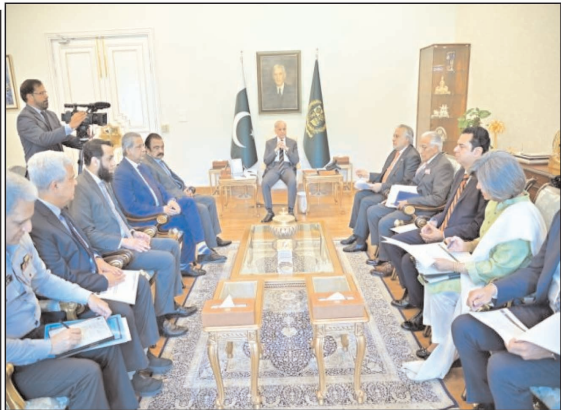
ISLAMABAD: Prime Minister Muhammad Shehbaz Sharif Chairing a meeting regarding the evacuation of Pakistanis from Iran and issues related to Pakistanis residing in Gulf countries.

"By the grace of Allah, Pakistani citizens are safely returning home from Iran, and the Pakistani Embassy in Azerbaijan is fully active in facilitating the process", the prime minister was told. The meeting was also informed that, on the prime minister's instructions, the Ministry of Foreign Affairs was continuously monitoring the entire situation. A briefing was also given on the measures taken by Pakistani embassies to facilitate Pakistani citizens residing in Gulf countries. The meeting was attended by Deputy Prime Minister and Foreign Minister Senator Ishaq Dar, federal ministers Azam Nazeer Tarar and Attaullah Tarar.