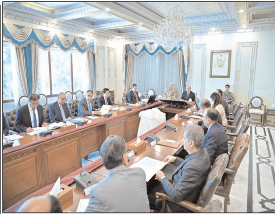
ISLAMABAD: Prime Minister chaired a review meeting on promotion of cashless economy in the country.

The meeting was further informed that in last year, 24 percent of beneficiaries had received the amount by the 12th day.